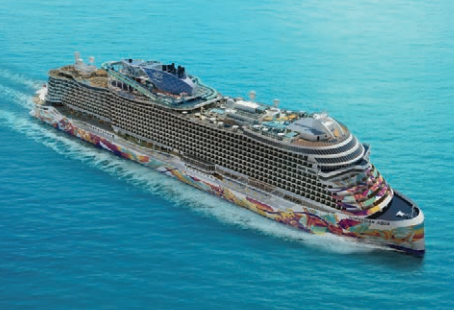
NORWEGIAN AQUA<sup>™</sup> – Coming 2025