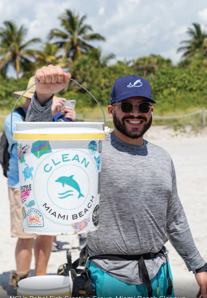
NCL's Rebel Fish Creative Group, Miami Beach Cleanup