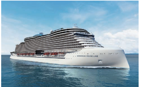
NORWEGIAN PRIMA PLUS CLASS IV-VI Coming 2026–2028